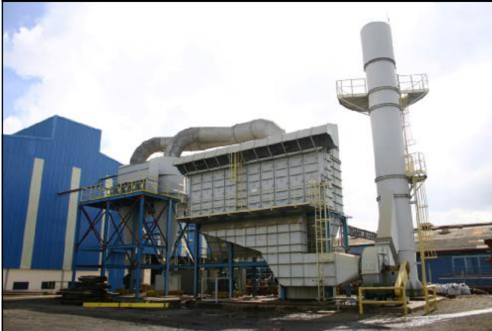
WHB – Curitiba/PR